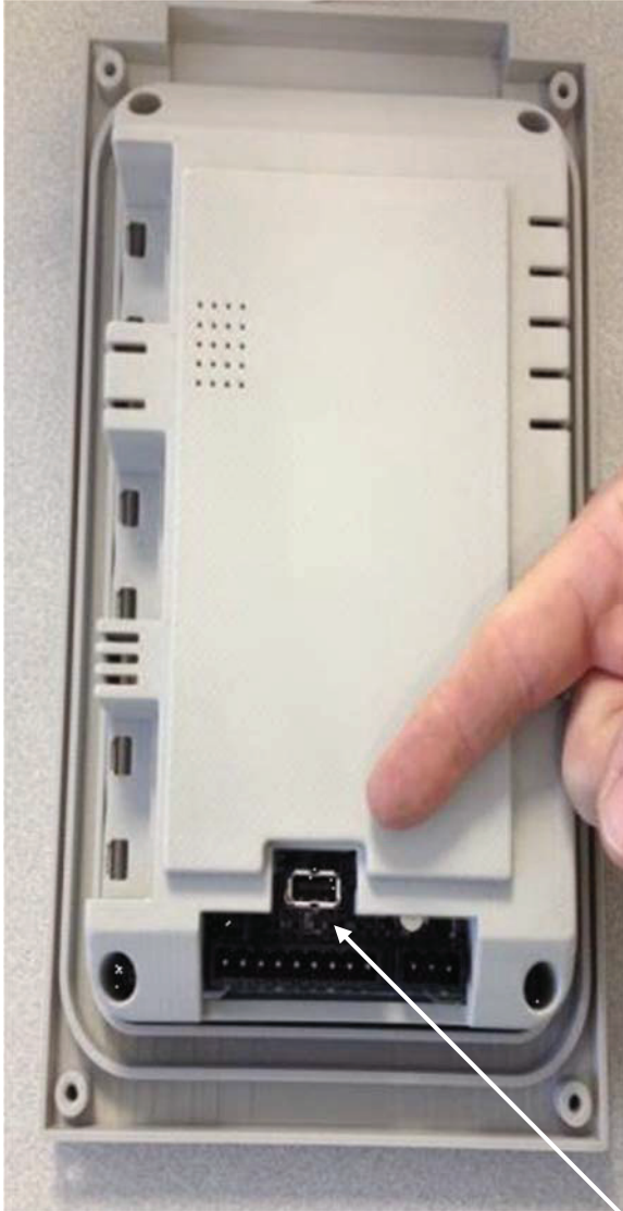
Figure 4-1 Rear USB Port